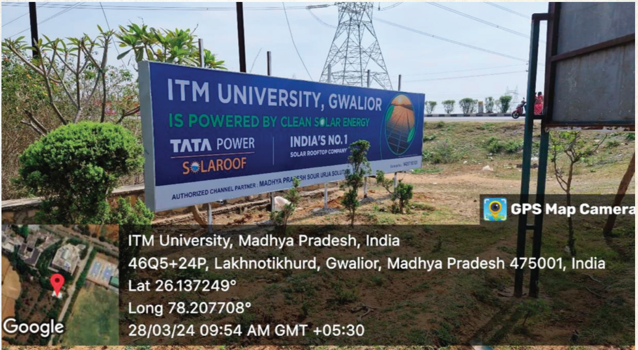
Photos of Solar Energy with Tata Solar and its contribution to climate change