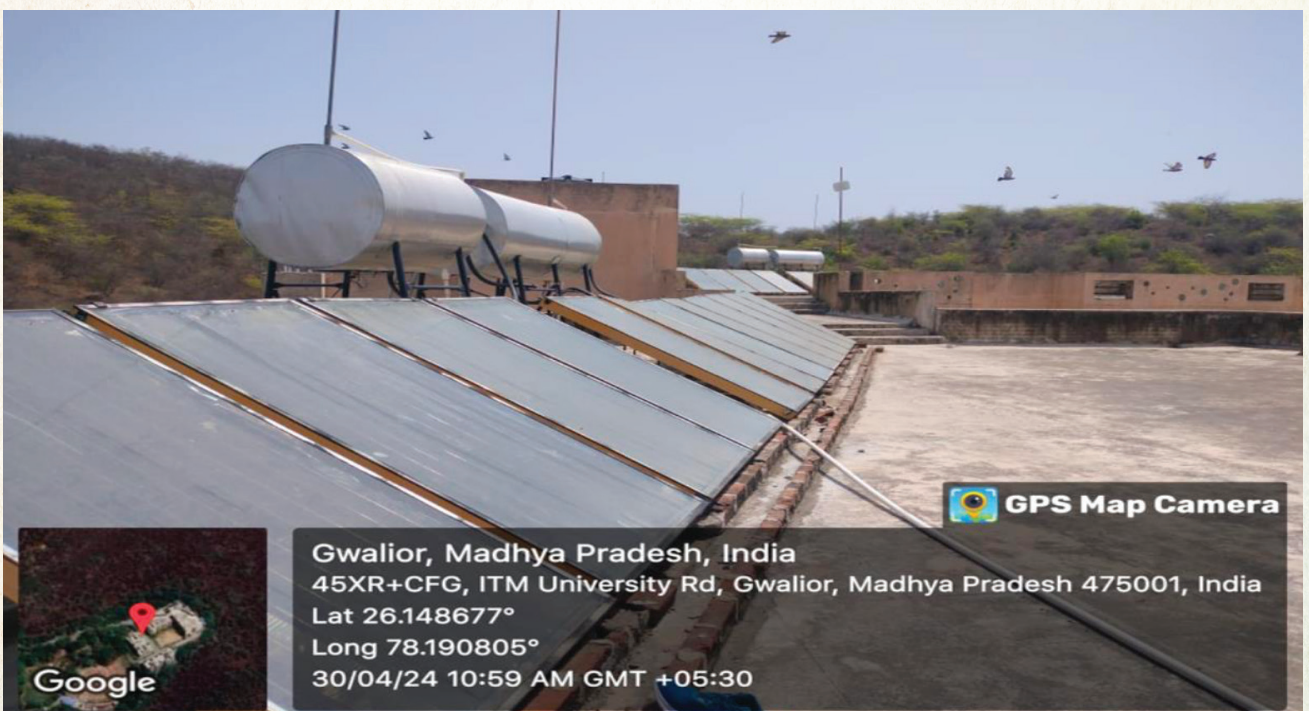
Solar water heating panels on hostel and residential complex