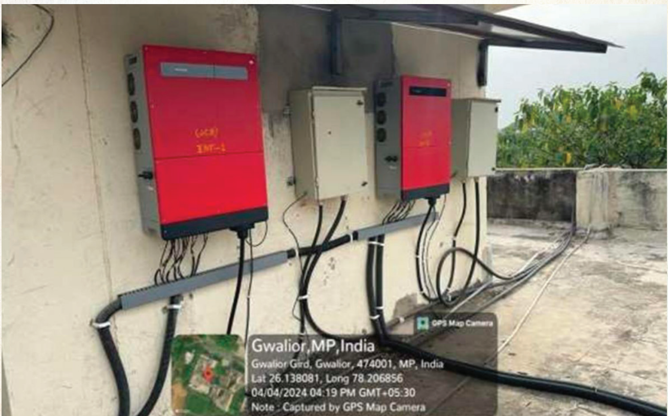
Photos of solar plant & net metering photographs