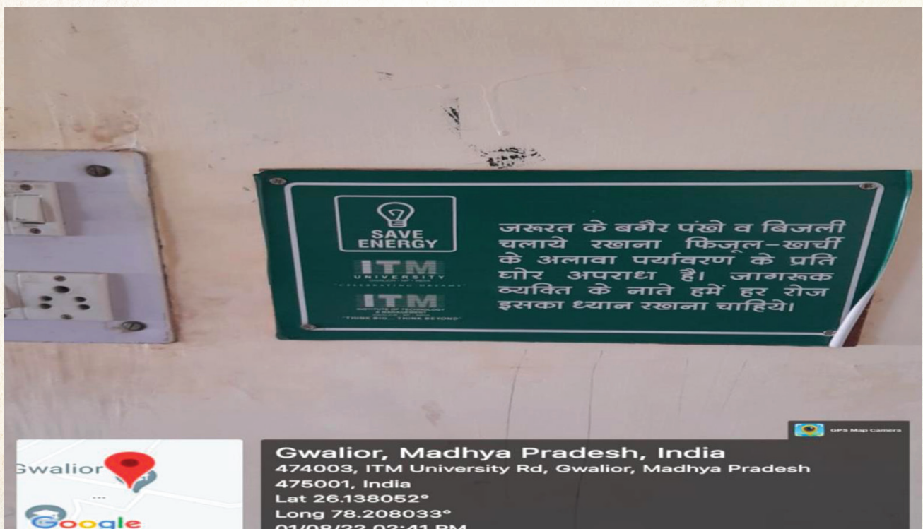
Save Energy Message at Various Blocks