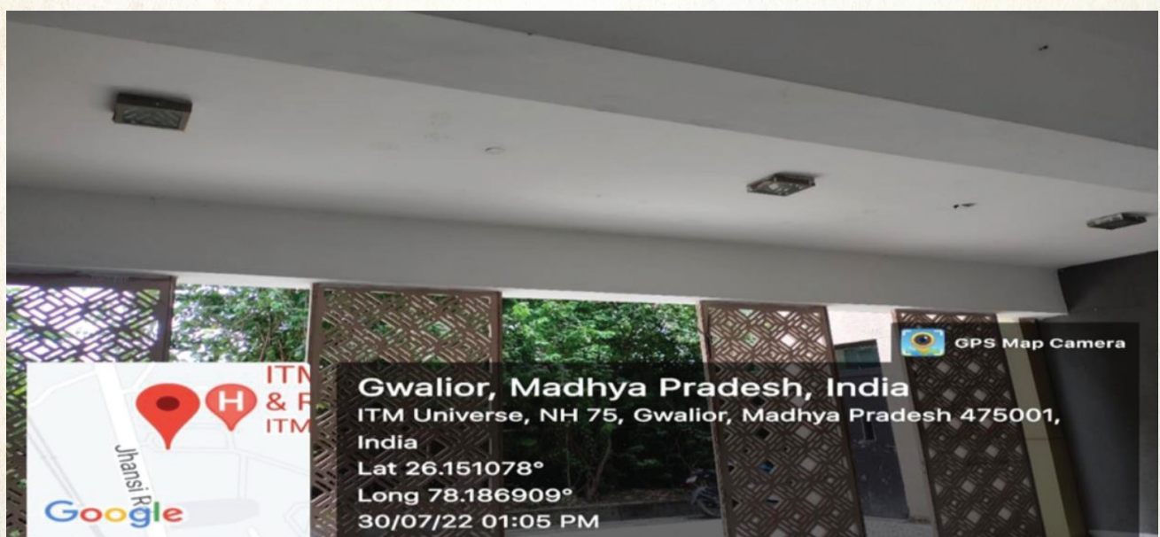
Installed LED BULBS at various Blocks