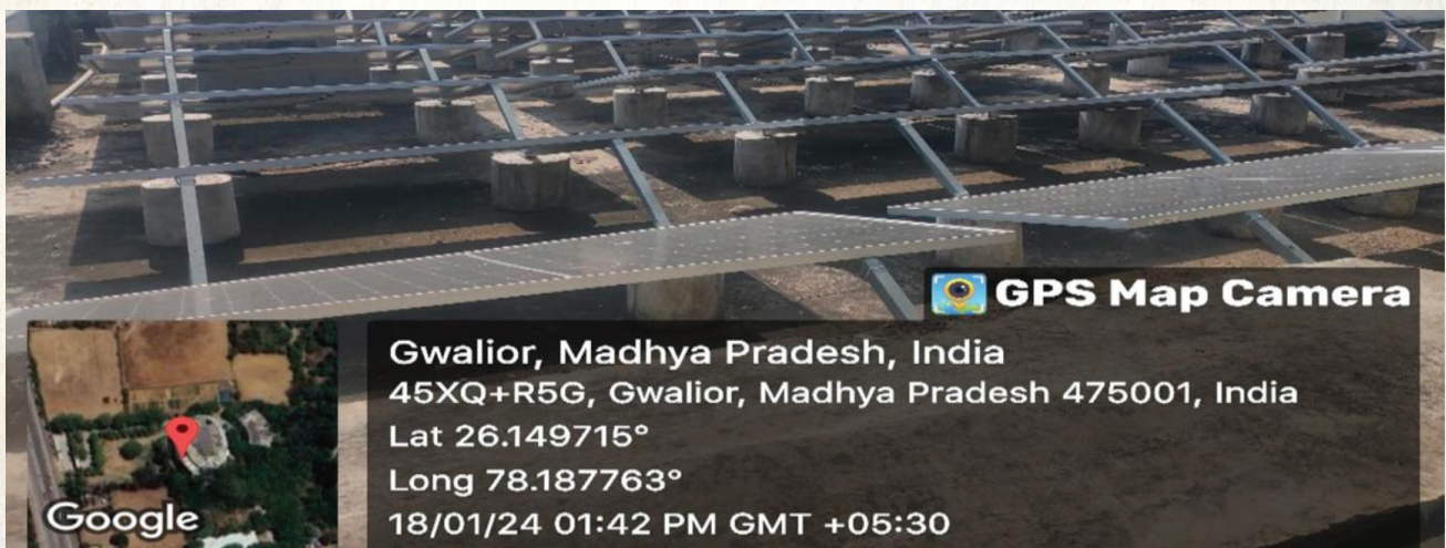
Photos of Solar panels on the roofs of JC Bose Block building

Solar roof panels are photovoltaic modules installed on rooftops to harness solar energy for electricity generation. These panels capture sunlight and convert it into usable electricity, providing a sustainable and renewable energy source for homes and businesses. Solar roof panels help reduce reliance on traditional fossil fuels, lower electricity bills, and contribute to environmental conservation by reducing carbon emissions. They offer a practical and eco-friendly solution for powering buildings with clean energy. There are solar street lights also installed in the campus for night lighting, solar water heaters are also installed on the roofs of hostel, residential complex, guest houses.